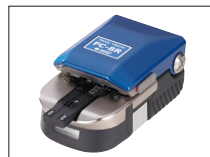
Handy cleaver FC-8R series