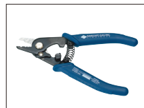
Jacket remover JR-M03