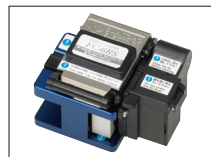
Table-top cleaver FC-6 / FC-6R series