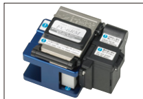
Table-top cleaver FC-6 / FC-6R series