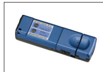
Hot jacket remover JR-6+