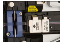
Pitch changing holder PCH-12