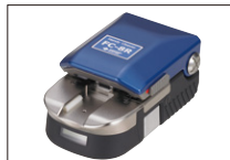
Handy cleaver FC-8R series