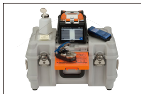
Carrying case with worktable CC-72

Items listed in Basic Accessories are always included with the splicer body. Overall kit content may vary regionally. Please check with your local authorised reseller to confirm kit content in your region.