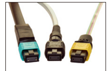
Available for Lynx-Custom Fit™ Splice-On Connector